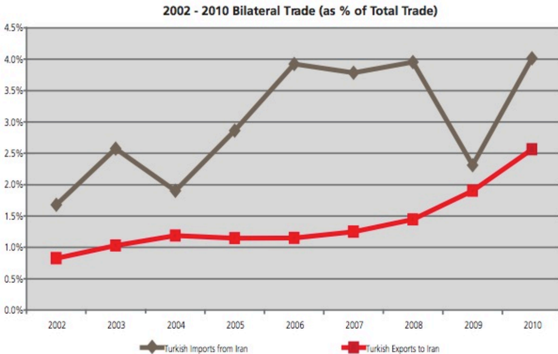
Chart 2: Turkish-Iranian Trade from 2002-2010 in as a percentage of total Turkish trade.