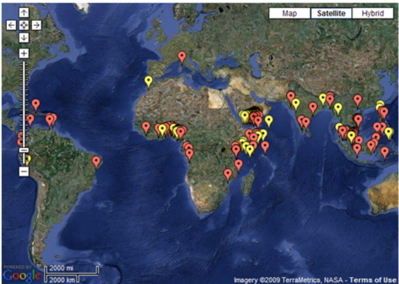
Figure 1: Global display of piracy in 2008. Source ICC, 2008).

Privy Council, In re piracy jure gentium, http://www.uniset.ca/other/cs5/1934AC586.html , (Last visited, 09-20-2009).