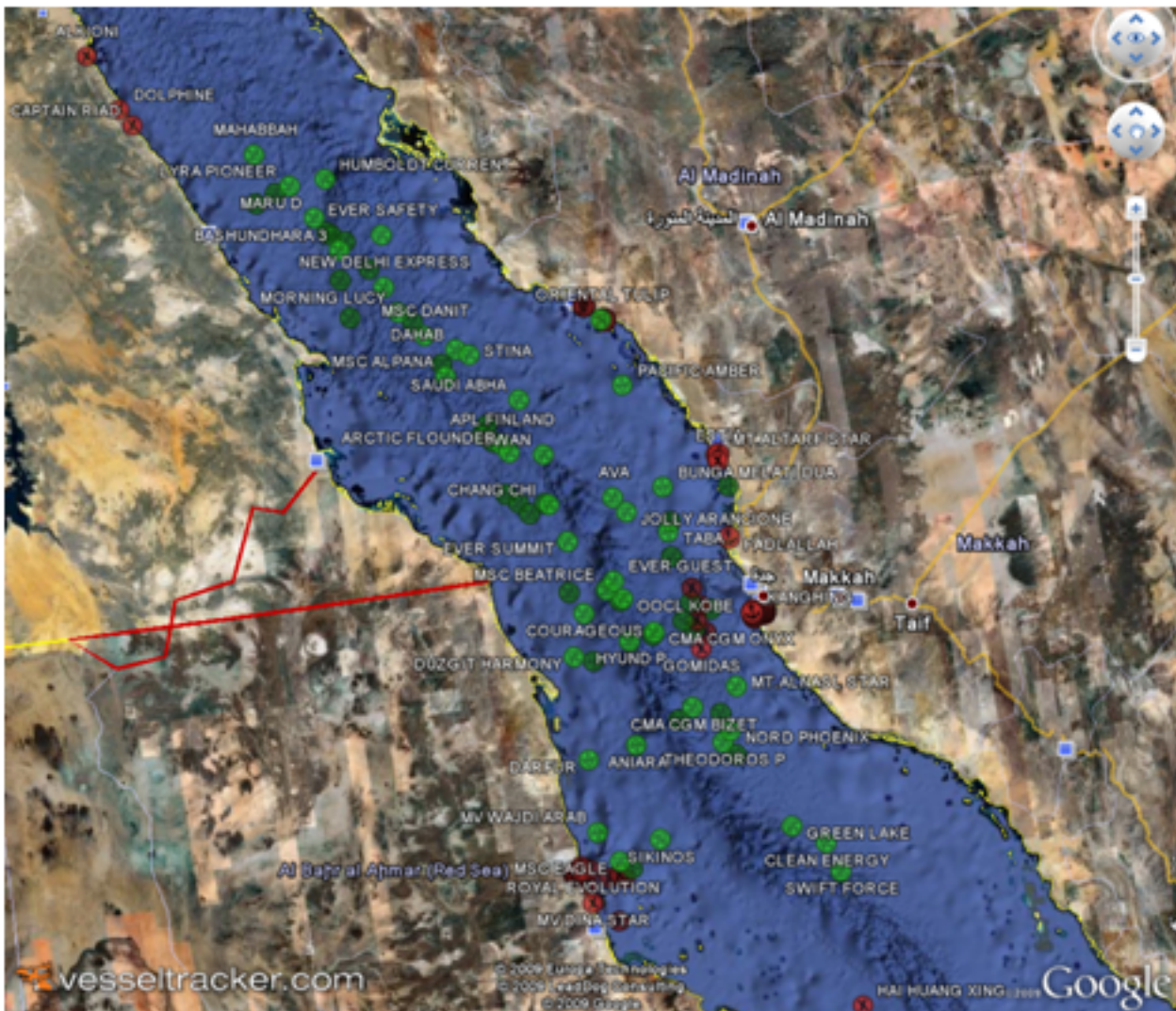
Figure 2: A live image via Google Earth of ships in the Red Sea moving towards and from the Gulf of Aden.