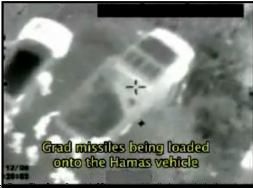
Plate 4: Combat Zone. The Gaza Strip of UNOD. Drone imagery showing Grad missiles being loaded onto a Hamas vehicle

Manufacturing and communicational infrastructures facilitate objects to project political powers over geography. These connections are strategically diplomatic to build and solidify new and existing relationships with states. It can be suggested these interrelationship networks of alliances add new dimensions to globalising the battlefield, contributing to the first strand of this argument of time-space compression (see Bridge, 1997; Harvey, 2005[1990]). Alliances are much more powerful, both politically and militarily in succeeding in the Gaza conflict. American support for the drone attacks located across the Gaza Strip and in the West Bank provides (to some extent) a legitimate justification for the extensive use of UCAVs against the Palestinians. Israeli power is strengthened by the use of UCAVs due to the reinforcement of alliances through manufacturing drones and their operational tasks.