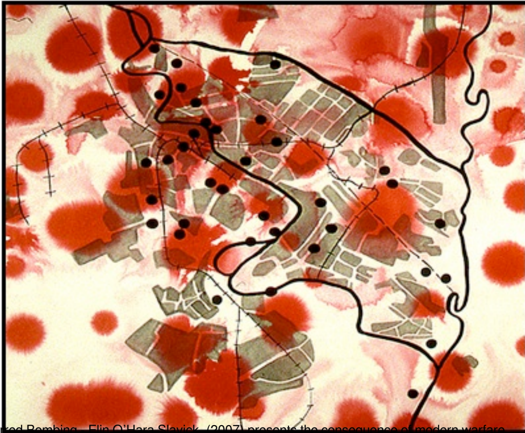
Plate 3: Blurred Bombing—Elin O'Hara Slavick, (2007) presents the consequence of modern warfare

UCAVs are representative of a technological revolution that forces geography to obey.