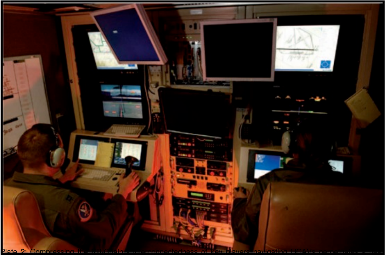
Plate 2: Compressing the air-main, time-space compression of key players navigating UCAVs, preparing for the dimension of time-space compression.

The final strand of critical engagement with UCAVs explores the technicalities of the operational process of 'targeting'. Targeting the enemy through hi-resolution, and infra-red cameras built onto the body of the UCAV requires the operator to identify between 'target' and 'civilian'. This God-like practice of identity classification results in the decision-making of life and death (Haraway, 1988). Thus, the ability to choose to create identities but also to destroy them in conjunction with powerful visualities gives UCAVs the ability to alter the future of place. Shaping geographical futures is a powerful political tool of the Hermes 450 greatly benefitting the IDF over the Palestinians in Gaza.