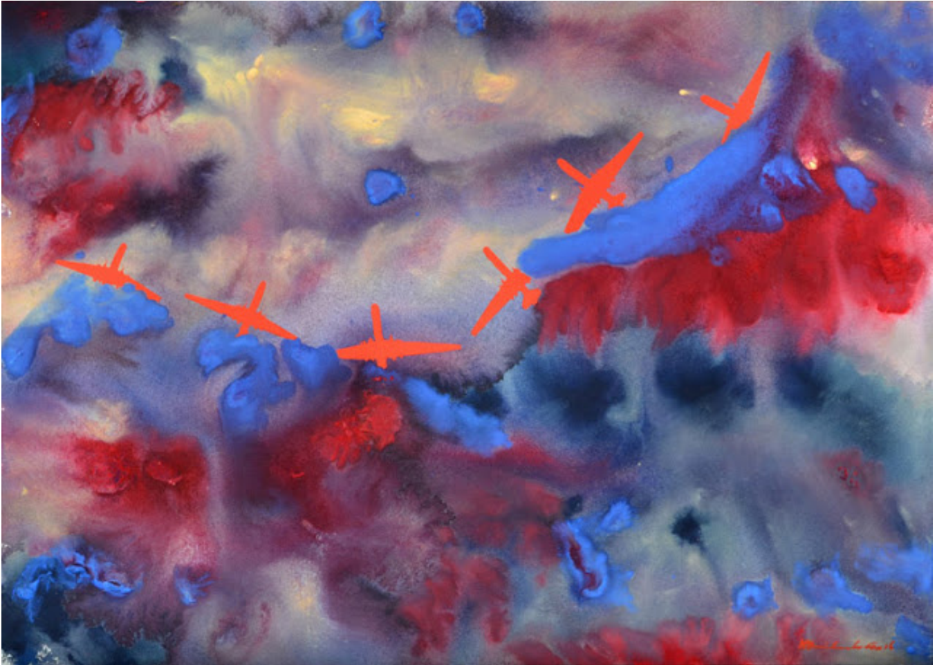
The Edge Gouache on paper 30 x 42 cm 2016.

Edge dares the viewer not to think of death when they look at the bloodied landscape. A disturbing deep blood red mixes with the dust of Earth. From a cosmic perspective, typical of Brimblecombe-Fox's work, red and blue allude to stardust from which we came and to which we will return, inevitably. This reading makes the purpose of war seem even more abjectly futile. The drones, semi-hidden behind the clouds, do not look innocent, but certainly show an indifferent attitude. They have just done their job. Are you comfortable with it?