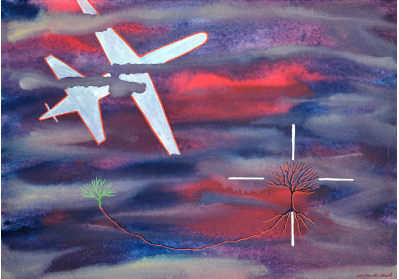
New Shoots Gouache on paper 30 x 42 cm 2016. Courtesy of the artist.

fresh new life. During her time living in rural Australia, Brimblecombe-Fox has come to realise the self-regenerating potentials of life. Trees are the emblem of that. Thus, the trees-of-life in Dropescapes aims at sending a message of hope across humanity, an incitement to resist.