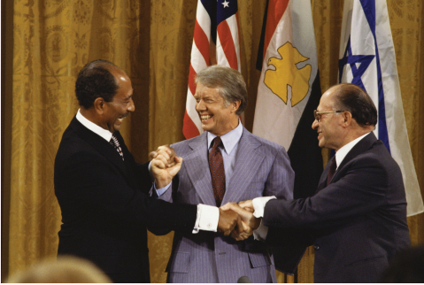
Photo 2.2 Carter, Sadat and Begin after the Camp David Accords, 18 September 1978