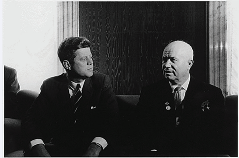
Photo 2.4 Kennedy and Khrushchev in Vienna, April 1961