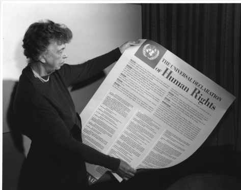
Photo 2.5 Eleanor Roosevelt holding a poster of the Universal Declaration of Human Rights, New York, November 1949