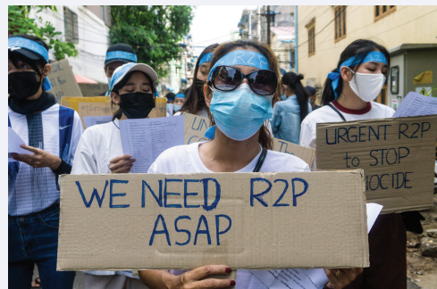
Photo 2.6 Protesters hold signs relating to 'R2P' as they take part in a demonstration against the military coup in Yangon, Myanmar on 12 April 2021

Building on the momentum of establishing a range of legal norms, the Responsibility to Protect (2001), sometimes referred to as 'R2P', was endorsed by all member states of the United Nations in 2005. It sought to build further on the Universal Declaration of Human Rights and subsequent documents by establishing higher levels of punishment for the worst violations by states. In principle, this involves a reinterpretation of sovereignty (at times) to the level of the individual. To illustrate this, under the Responsibility to Protect, sovereignty can be imagined as similar to a mortgage given by a bank (the United Nations) to a homeowner (a nation-state). Should states keep up their repayments (by treating their people well) then the bank will never trouble the homeowner. However, if the state does not keep up its repayments (by acting in ways that cause its people undue harm and suffering) then that state may be repossessed by the