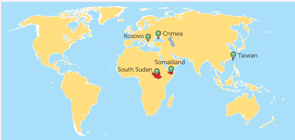
Map 2.1 Illustrating sovereignty